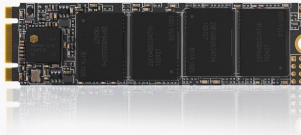
Longline 256GB M.2 SSD 2280/256G M.2 SATA 3.0 SSD LNGM2SATASSD2280256G