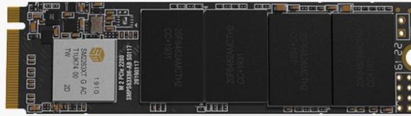
Longline 256GB NVMe M.2 SATA SSD 2100/2100 MB/s LNG2100/256GN